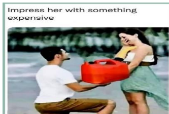
Impress her with something expensive