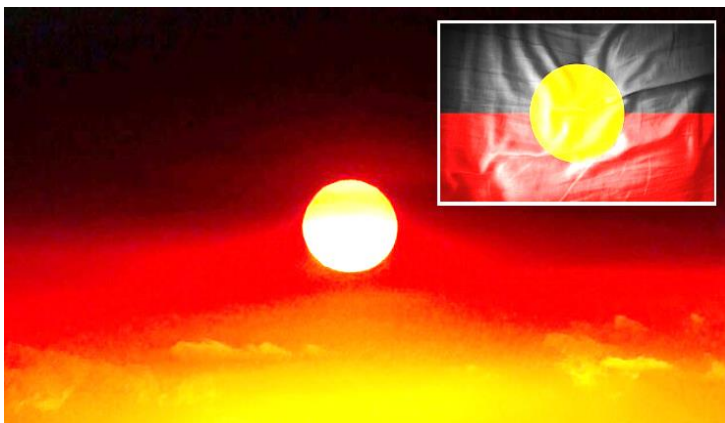
Bushfires turn the sky into the Aboriginal flag, stunning Australians

(26 January – Australia Day/Survival Day)