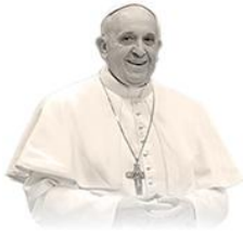
Franciscus Jorge Mario Bergoglio 13.III.2013 21.IV.2025

Gospel – John 20:19-31 ( After eight days Jesus came in and stood among them. )